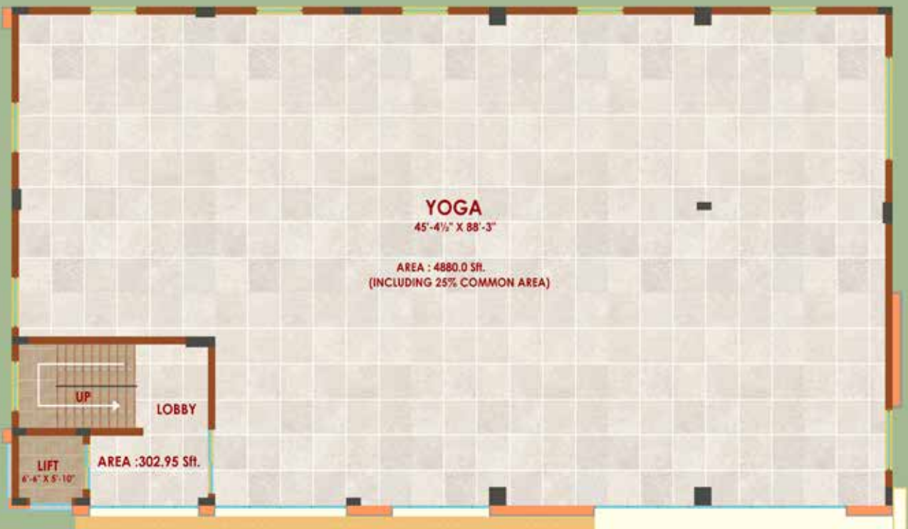
SECOND & THIRD (TYPICAL) FLOOR PLAN