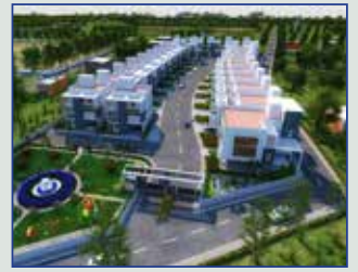
On Going Projects